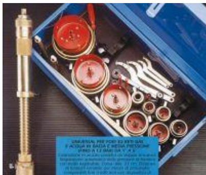
RAVETTI ART 325 1 - 6" HOT TAPPING/DRILLING MACHINE