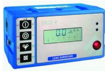
GMI LEAKSURVEYOR FAST RESPONSE, PPM, %LEL & VOL