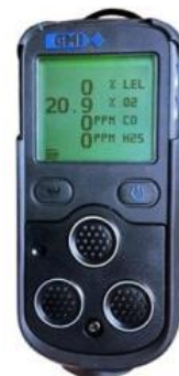
GMI PS200 CONFINED SPACE, 4 GASES PUMPED PERSONAL DETECTOR