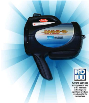
HEATH RMLD REMOTE METHANE LEAK DETECTOR