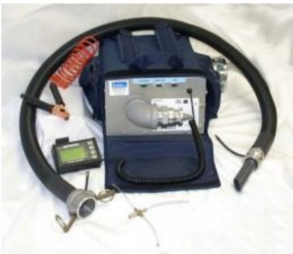
HEATH HI-FLOW SAMPLER FUGITIVE EMISSIONS SAMPLER