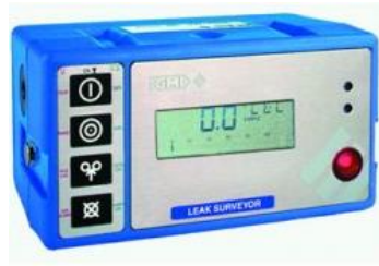
GMI LEAKSURVEYOR FAST RESPONSE, PPM, %LEL & VOL