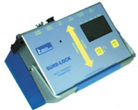
HEATH SURELOCK PIPE LOCATOR