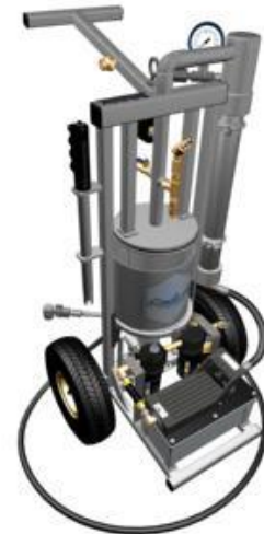
SEALWELD ACTIV-8 PNEUMATIC/HYDRAULIC PUMP 10,000 PSI