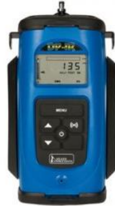
HEATH DPIR INFRARED DETECTOR