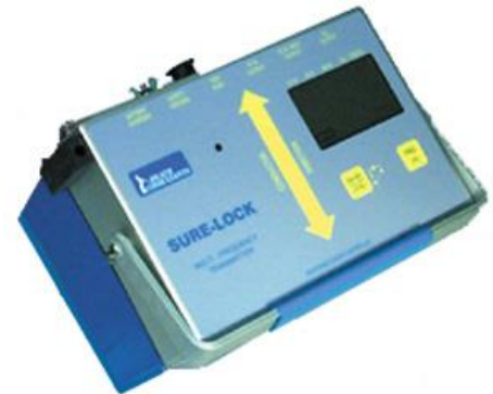
HEATH SURELOCK PIPE LOCATOR