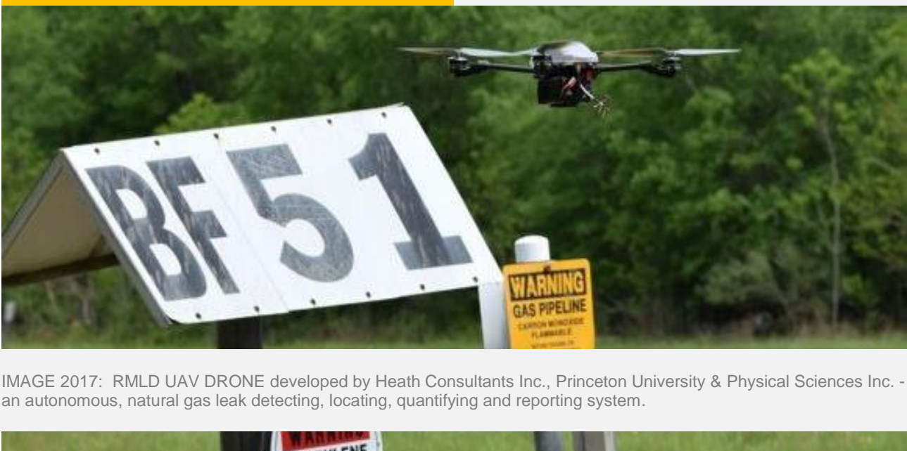
IMAGE 2017: RMLD UAV DRONE developed by Heath Consultants Inc., Princeton University & Physical Sciences Inc. - an autonomous, natural gas leak detecting, locating, quantifying and reporting system.

In addition, HPS annually sponsors the highly demanded, (Canadian) Sealweld ValvePro and Valve Technician schools, at cost, in support of our industry.