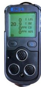
GMI PS200 CONFINED SPACE, 4 GASES PUMPED PERSONAL DETECTOR