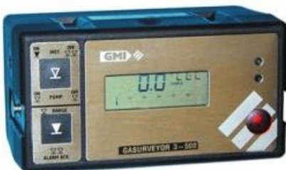
GMI GASURVEYOR 3-500R %LEL & VOL GAS/AIR PURGE