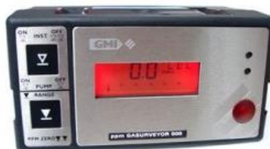
GMI GASURVEYOR PPM 500 FAST RESPONSE PPM, %LEL & VOL