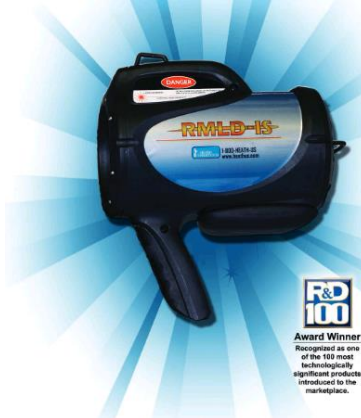
HEATH RMLD REMOTE METHANE LEAK DETECTOR