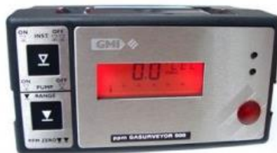
GMI GASURVEYOR PPM 500 FAST RESPONSE PPM, %LEL & VOL