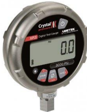
CRYSTAL PRESSURE GAUGES 70 BAR XP2i