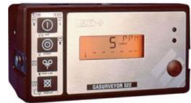
GMI 512 CONFINED SPACE, PPM, %LEL & VOL