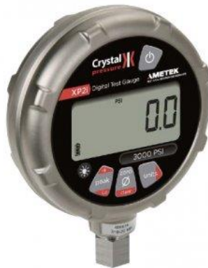
CRYSTAL PRESSURE GAUGES 70 BAR XP2i