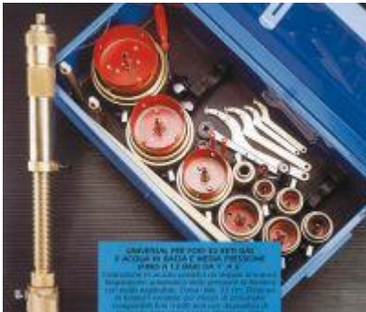
RAVETTI ART 325 1 - 6" HOT TAPPING/DRILLING MACHINE