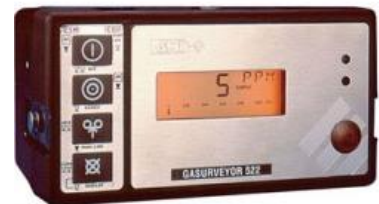
GMI 512 CONFINED SPACE, PPM, %LEL & VOL