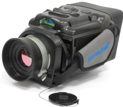
EYECGAS FUGITIVE EMISSIONS CAMERA